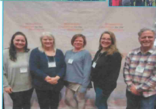
The Housing Team attended MN Coalition for the Homeless Conference