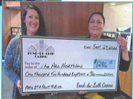
Thank you guests of Fond-du-Luth!